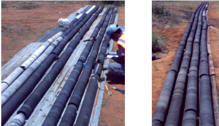
Waterberg #1 core samples