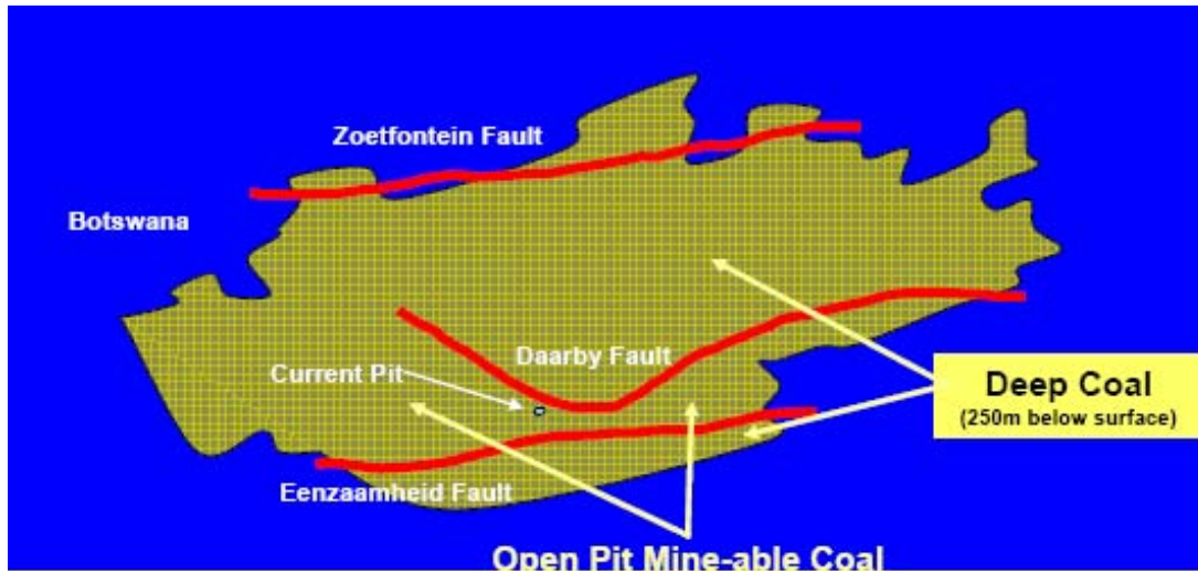
Figure 3: Geology of the Waterberg area.